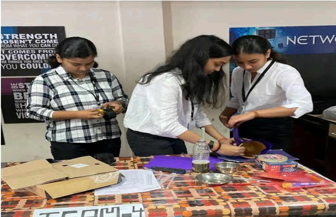
DLLE students make things from waste